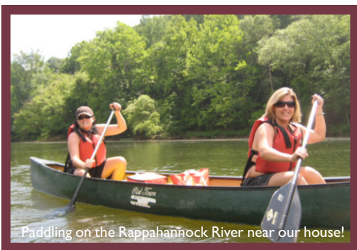
Paddling on the Rappahannock River near our house!