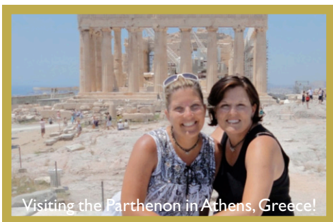
Visiting the Parthenon in Athens, Greece!